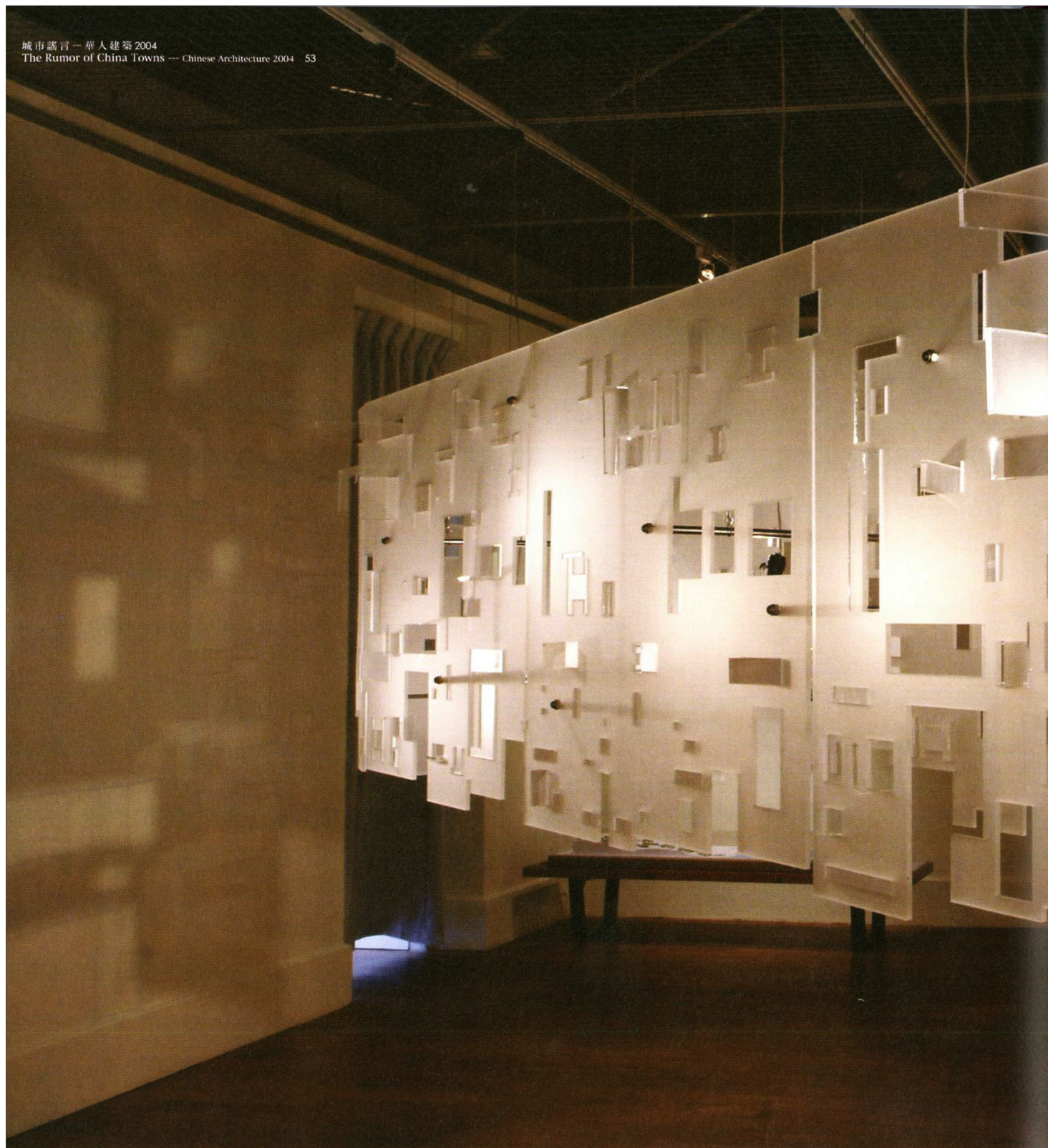
陳家毅 院子建築與我 2004 複合媒材裝置 754 x 580 x 289cm