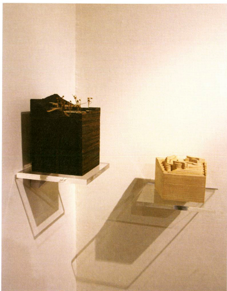
陳家毅 院子建築與我（局部） 2004 複合媒材裝置 754 x 580 x 289cm